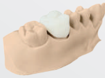
Temporary Crowns 55 per print 30 min