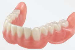
Denture Bases 4 per print 120 min