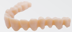
Denture Teeth 3 per print 45 min