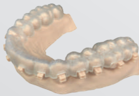
IBT 3 per print 80 min