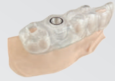
Surgical Guides 10 per print 50 min