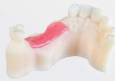
Gingiva 45 per print 40 min