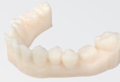
Dental Models 3 per print 50 min