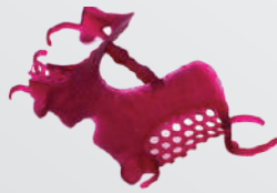
Removable Partial Dentures 4 per print 60 min