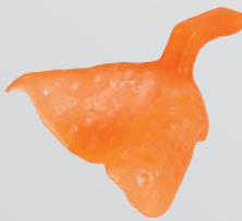
Impression Trays 2 per print 90 min