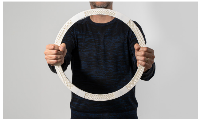
LCM-printed ALD ring with 15" diameter printed by Alumina Systems

Thanks to a build volume of 246 x 130 x 320 mm , the CeraFab S320 offers the maximum number of parts per print job. But it's not only about productivity – this machine can also manufacture the largest size parts of any CeraFab 3D printer. For example, three units of the 15" (380 mm) ALD ring shown below were printed in a total of 18 single segments for the semiconductor industry.